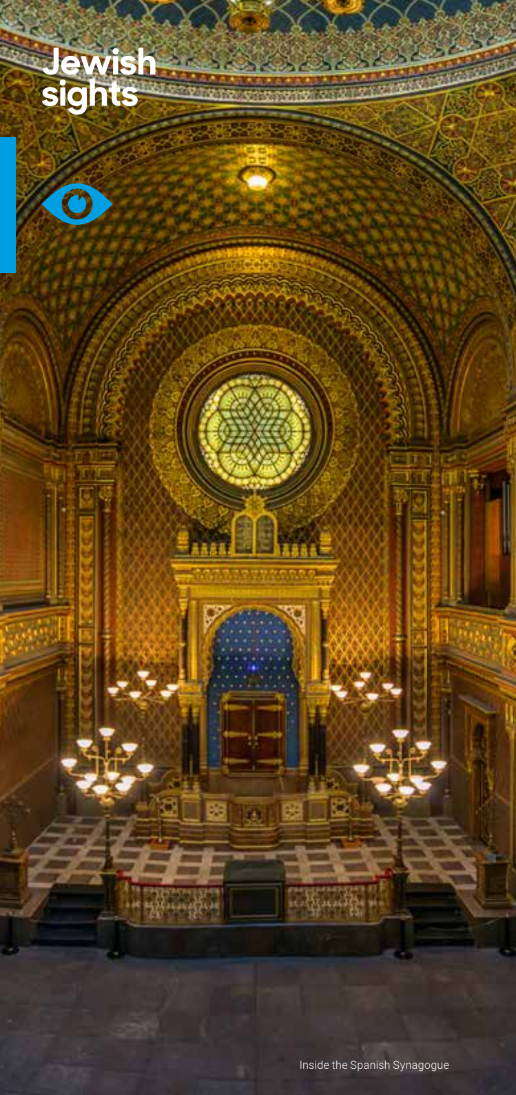
Inside the Spanish Synagogue