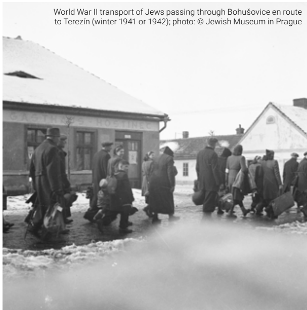
World War II transport of Jews passing through Bohušovice en route to Terezín (winter 1941 or 1942)

Fortunately, Jewish cultural landmarks outlasted the horrors of WWII. Some of them became the only refuge for the safekeeping of liturgical objects from the prior places of worship shut-down throughout the protectorate.