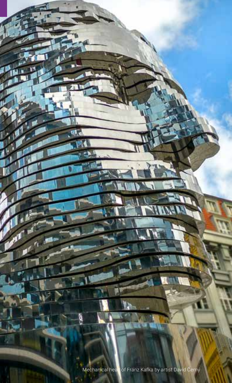
Mechanical heart of Franz Kafka by artist David Černý