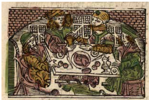
A family at the table (grace after a meal): an illustration from Seder zmirot u-virkat ha-mazon , Prague, 1514; photo: © Jewish Museum in Prague

Classic Jewish dishes include the gefi te fisch – chopped deboned fishmeat (typically carp) made into flattened cakes, slowly poached in broth, served chilled. Another traditional Jewish meal is cholent (or hamin). This classic Shabbat dish consists of stew that is prepared on Friday and allowed to cook slowly overnight until Saturday. Basic cholent contains meat, potatoes, pearl barley and beans. Traditional sundries are kishkeh (sausage casings stuffed with a mixture of flour and onion), kneidlach (dumplings) or kugel (pudding).