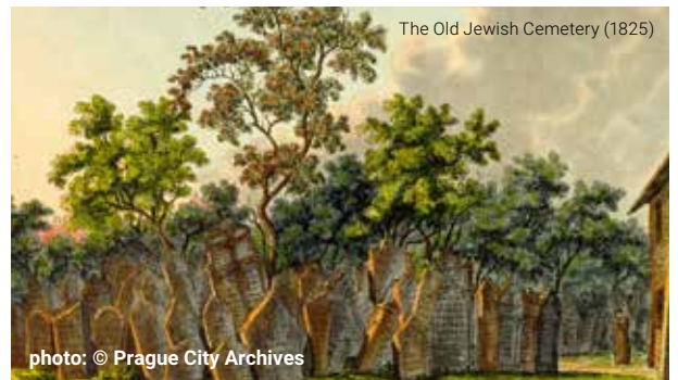
The Old Jewish Cemetery (1825)

Perhaps the fact that Jews came to Prague from different places helped the formation of two distinct centres of Jewish settlement . One around the Old School (today's Spanish Synagogue) and the other by the Old-New Synagogue. This was the real heart of the medieval Jewish ghetto. The merging of the two settlements was obstructed by the Benedictine enclave of St George at Prague Castle that included the Church of the Holy Spirit, whose Gothic profile can be seen right by the Spanish Synagogue.